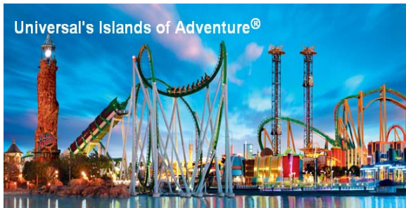
Universal's Islands of Adventure®

Take an unforgettable journey through Universal's Islands of Adventure® as the world's most cutting edge rides, shows and interactive attractions bring your favorite stories, myths, cartoons, comic books and children's tales to life. Around every bend is another epic adventure. Around every corner awaits another once-in-a-lifetime thrill. Join the battle of good versus evil above the streets of Marvel Super Hero Island®. Get splash happy with your favorite cartoon characters in the water rides of Toon Lagoon®. Come face to face with the dinosaurs of Jurassic Park®. Venture through the mists of time as you experience the epic adventures of The Lost Continent®. And step right into the pages of the children's books of Dr. Seuss in Seuss Landing™.